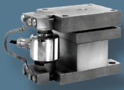
ADVANTAGE Series Load Point with C2 Calibration

Hardy carries a wide variety of strain gauge load points and scale bases to accommodate your application requirements.