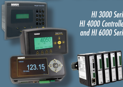
HI 3000 Series HI 4000 Controllers and HI 6000 Series