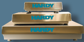
Hardy Bench Scales